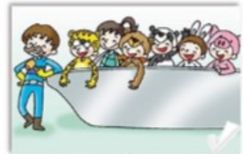
build, all animals