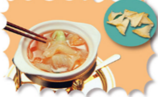
Shark fin soup made from shark fins