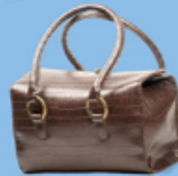
Leather handbags made from crocodile skins

Buying these things = killing these animals