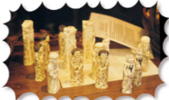
Ivory ornaments made from elephant tusks