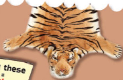
Rugs made from tiger skins